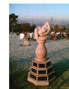
Herne Bay memorial

A new memorial to symbolise the love and care we want for our children.