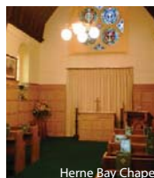
Herne Bay Chapel

Chapels with music playing facilities are available to hire for all types of services.