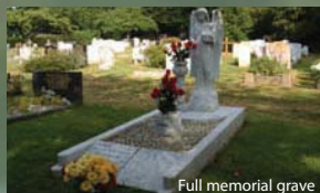
Full memorial grave

We can advise you on memorial and grave aftercare. Please contact us for details.