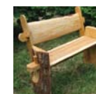
Rustic memorial bench