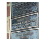
Metal wall plaques