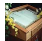
Remembrance book (traditional and computerised)