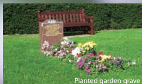
Planted garden grave