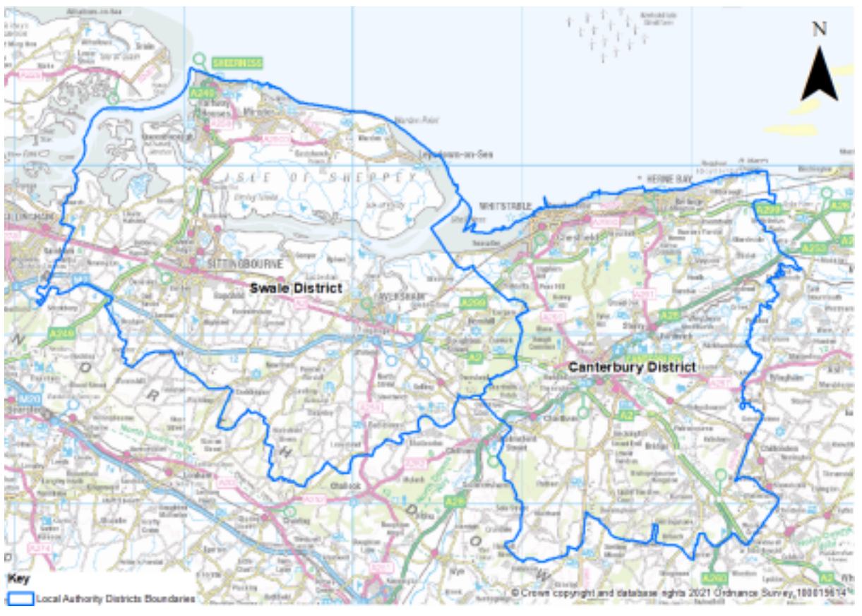
Figure 1 CCC and SBC boundaries.