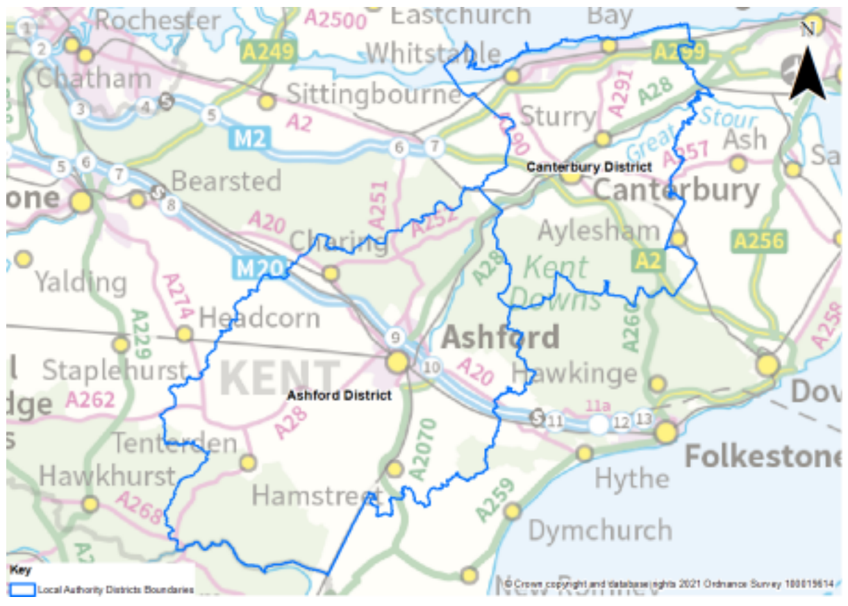
Figure 1 CCC and ABC boundaries.