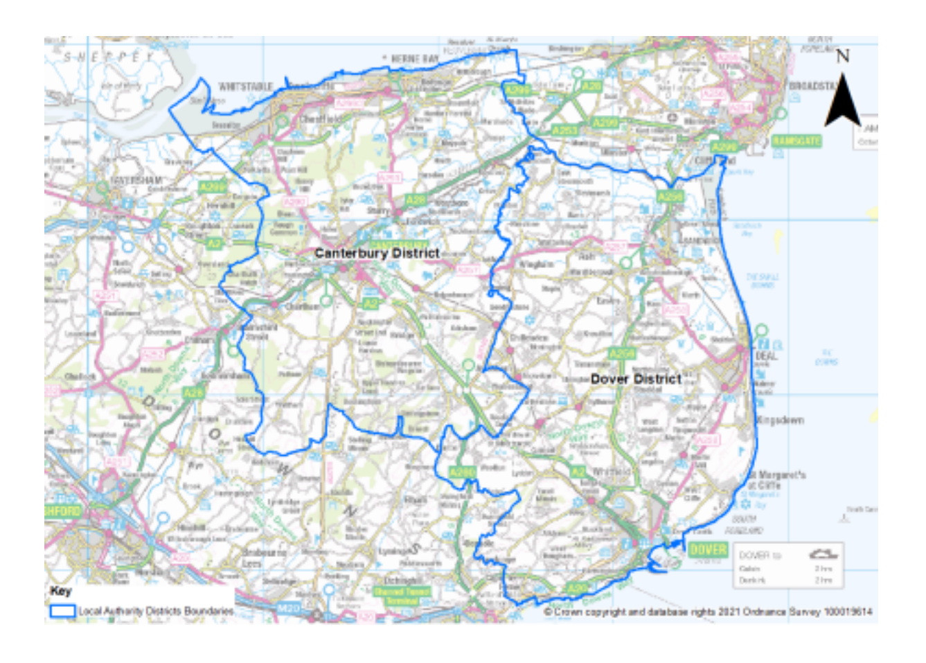
Figure 1 CCC and DDC boundaries.