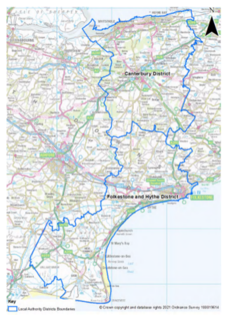
Figure 1 CCC and FHDC boundaries.