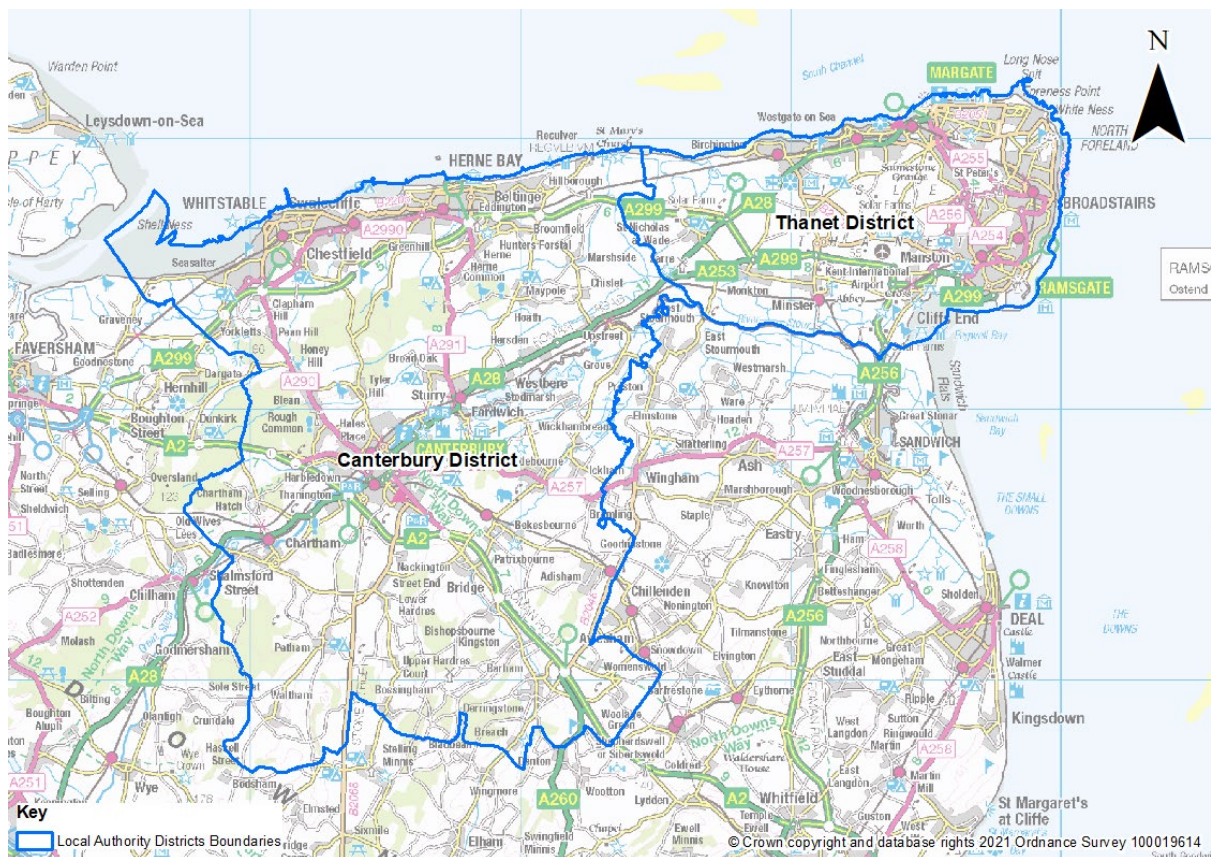
Figure 1 CCC and TDC boundaries.

1.3 The geographical relationship between the parties, reflecting local authority boundaries, is represented at Figure 1.